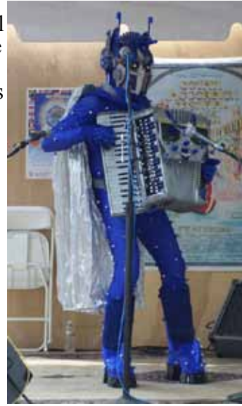
The Great Morgani

The Great Morgani sported a royal blue robot like outfit with platform shoes and played twice daily.