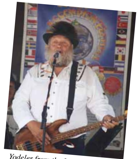
Yodeler from the Internationals