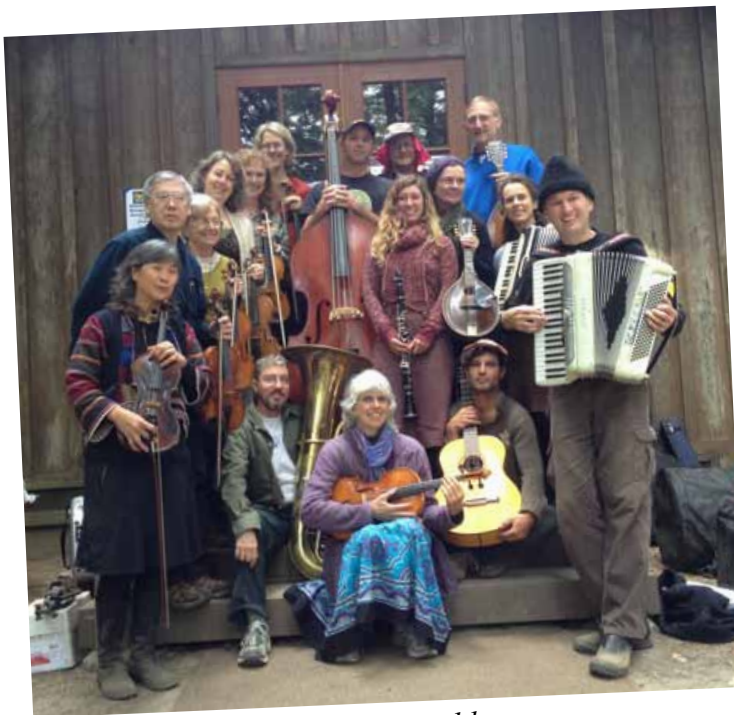
The Serbian and Balkan ensemble