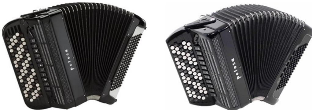
Petosa AM-1100C (C System) AND Petosa AM-4100 (B System)

I use the "C" system button arrangement because, like the treble pattern side, the low notes are toward the chin and the high notes are towards the feet. On a "B" system free-bass accordion, its arrangement is the opposite, thus making it confusing for a regular Stradella musician to feel comfortable to play. See examples of Petosa accordions below that show different button arrangements between the C and B systems.