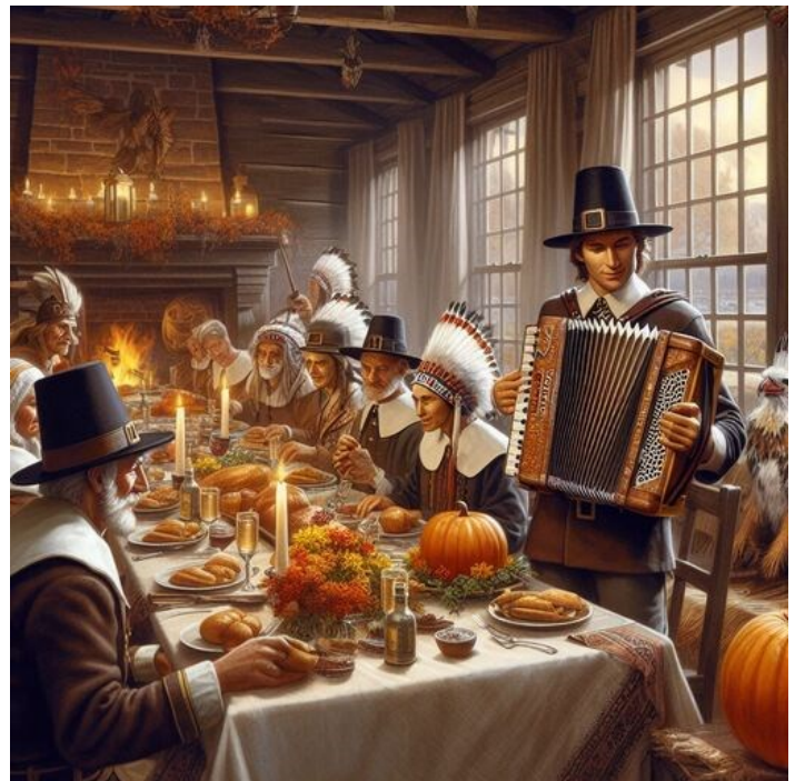
We are thankful for accordions

The San Francisco Accordion Club is a 501(c)(3) tax-exempt charitable organization whose purpose is to enhance, promote and stimulate an appreciation for the accordion within the membership and throughout the general public. Donations are tax-deductible and gratefully accepted by using the Donate button at www.sfaccordionclub.com