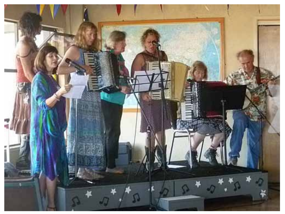
Group performing the Accordion Club Anthem, see next page