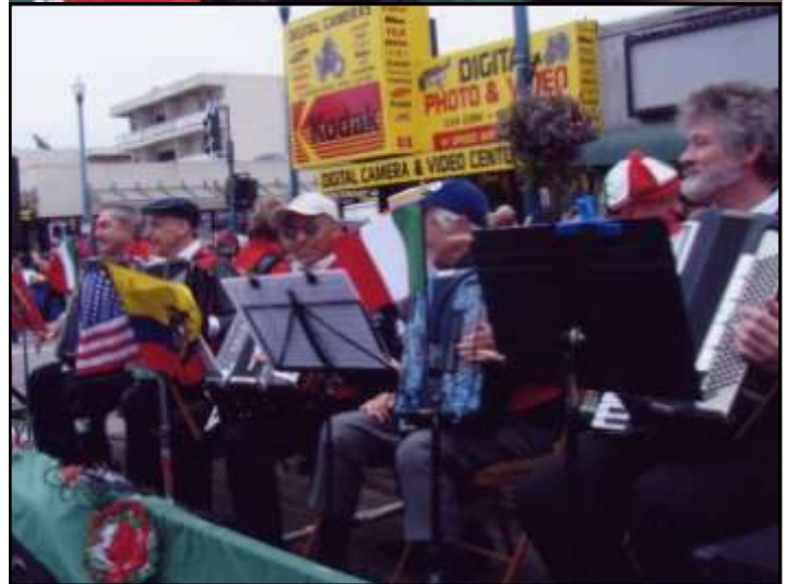
The members of the Band!