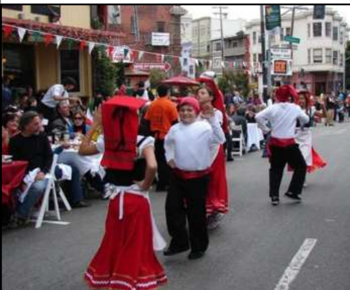
The dancers in action!