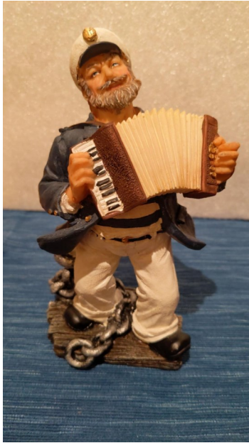
Sailor Man accordion figurine

Proceeds benefit the San Francisco Accordion Club