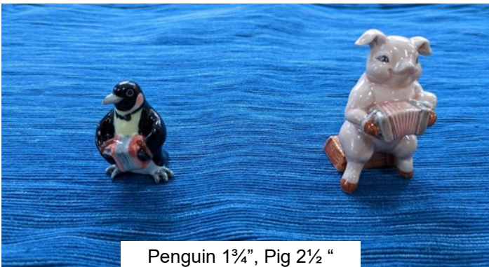
Penguin 1¼", Pig 2½ "

Two adorable accordion figurines for sale, $35 each OBO (+Shipping)