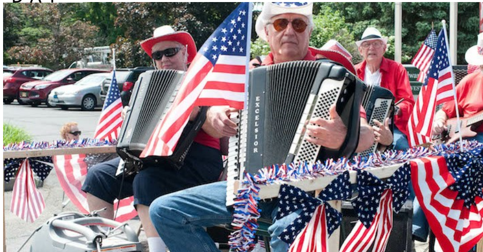
Memorial Day Parade, Bethlehem NY, 2022

https://spotlightnews.com/towns/bethlehem/2022/05/25/memorial-day-parade-in-delmar-on-monday-may-30th/