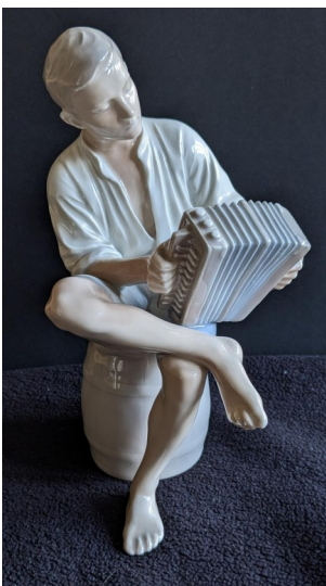
Bing & Grondahl Denmark Porcelain

Two adorable accordion figurines for sale, $35 each OBO (+Shipping)