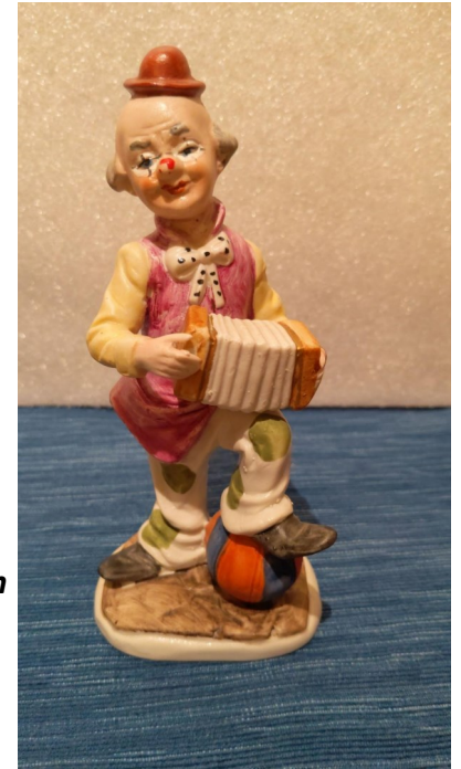
Clown with accordion

7 ½" high, apparently heavy-duty plastic $30 OBO (+Shipping)