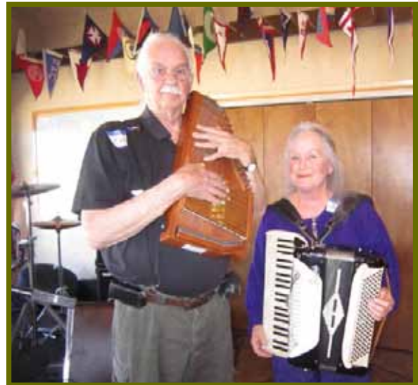
Harper & Reed