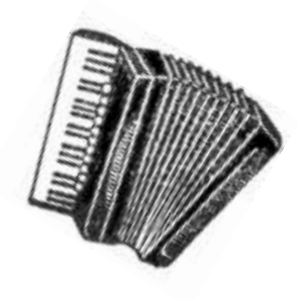
The official instrument of San Francisco!