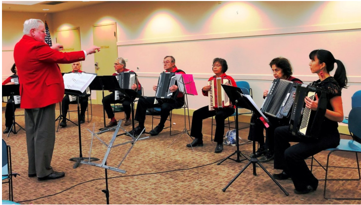
With best wishes for the New Year and an exciting 2019 season!