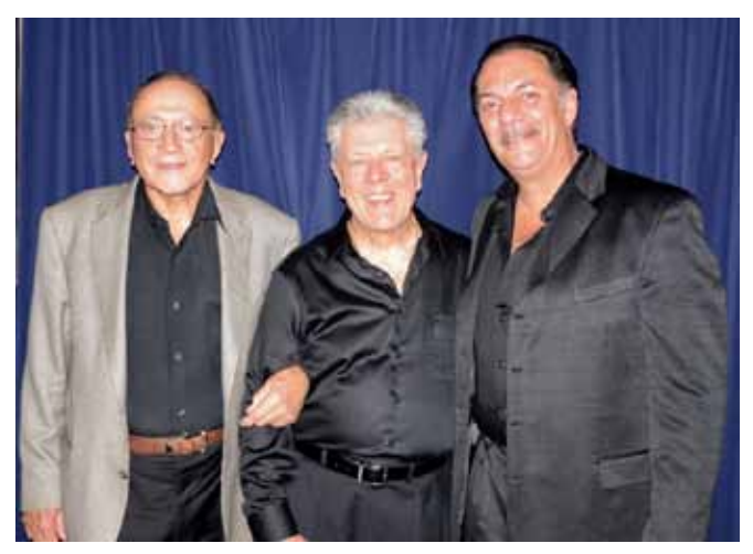
The Accordion Kings