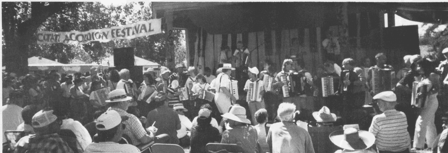
Lady of Spain-a-Ring at Cotati on Sunday

everyone, e.g. specific location of the Jam or Polka Tents. As one looked around the crowd, one saw many people my age and older. (Not that I'm that old, you under-