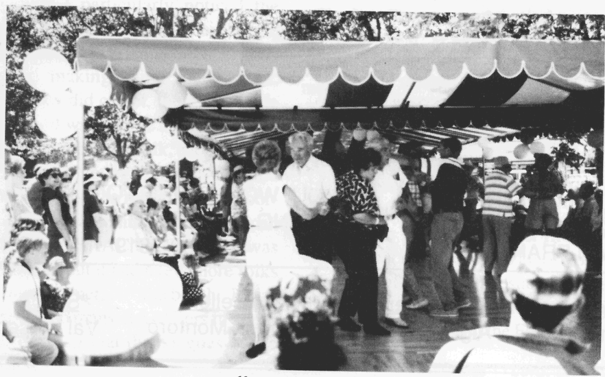
Polka Tent at Cotati