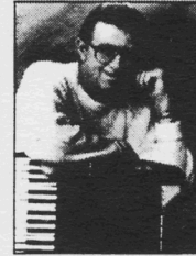
Art Van Damme