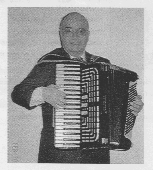
The BAAC Page February 2002