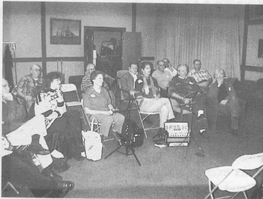
Some of the Workshop Participants