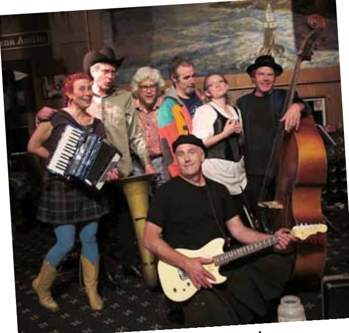
The Mad Maggies perform Friday Evening in front of the Rohnert Park Library—pg. 4

No August meeting! See you at the Cotati Festival! schedule on pg. 4