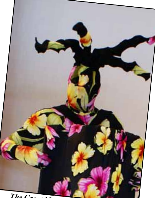
The Great Morgani as Hibiscus