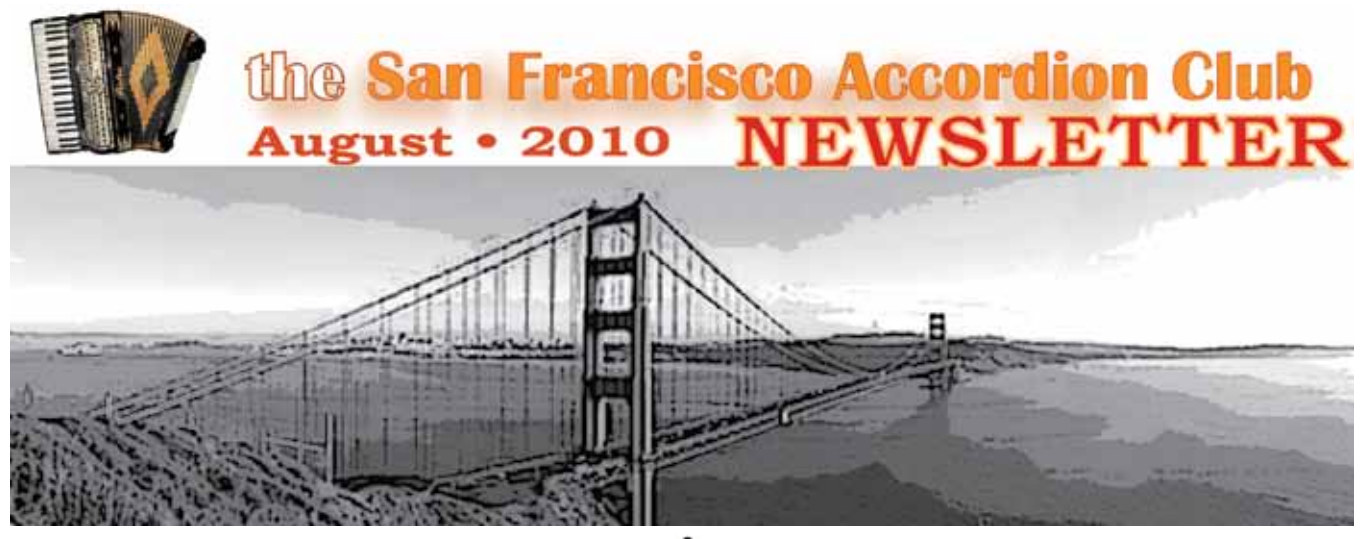
The World's First Accordion Club since 1912 🗳 Visit us online @ www.sfaccordionclub.com